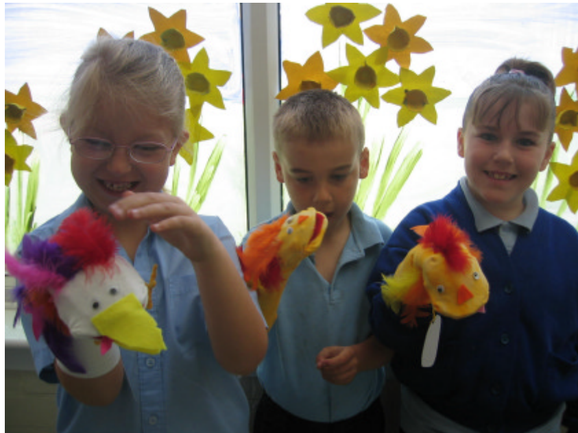
Enterprising pupils make puppets to sell at the school fayre