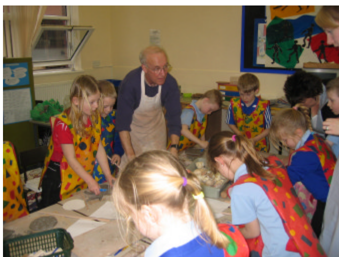
Governors helping out with clay work

Visits from artists, authors and musicians as well as visits to stately homes, the Mining Museum and Jorvik are a regular feature in school and contribute effectively to our creative curriculum.