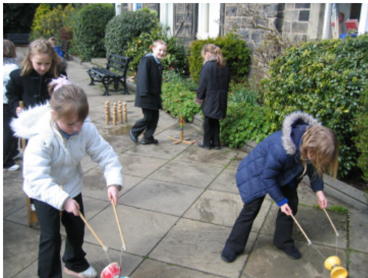
Visit to the Dewsbury Toy Museum

Before each visit takes place parents will be informed of the cost and asked to make a contribution towards it. Hopefully all parents will contribute, but should the total contributions be less than the cost of the trip then the balance will have to be made up from school funds. If the amount is substantial then the trip may have to be cancelled. When most of the visit takes place outside school hours (i.e. residential visits) all participants must pay the full cost.