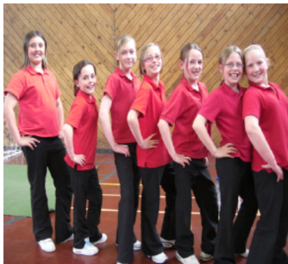
Wake Up Shake Up Competition Winners

A healthy competitive spirit is promoted where fair play and a responsible approach to winning and losing are the aims. Approximately two hours per week is allocated to individual and team sports/games within the PE curriculum. Games, gymnastics, dance and swimming are taught within the legal framework of the National Curriculum and children of all ages are given opportunities to take part in competitions and fun days organised for example by the local high school