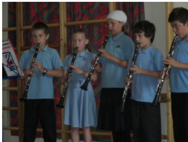
Musicians perform at our Strawberry Tea

Children at Havercroft have the opportunity to learn to play a range of musical instruments. The children are taught to play strings, woodwind and brass by peripatetic music teachers from the Local Authority Music Department. Although school is able to provide a small number of instruments, some pupils may have to provide their own. The Local Authority charges for music lessons which should be paid for before lessons begin. However, the Governing Body has agreed that school will make a contribution towards the cost of lessons so that no child will be denied the opportunity to learn to play an instrument because of their financial circumstances.