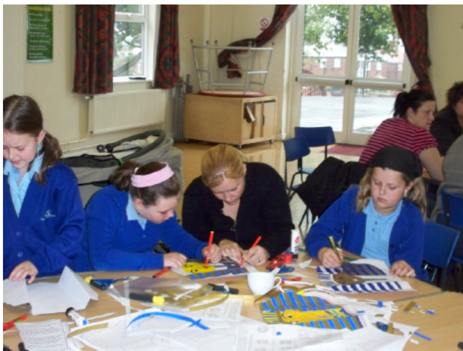
Parents involved with INSPIRE during Book Week

Further INSET days will be notified at a later date.